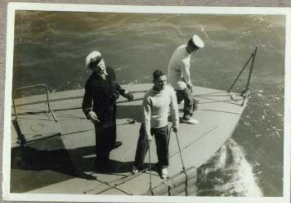
WE GOT "HELL" FROM THE ROYAL NAVY FOR SAILING OVER THE MINE FIELDS.