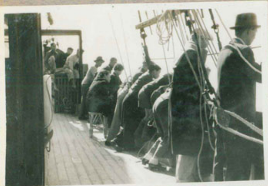
MOST OF OUR CHINESE GUESTS LINED THE RAIL